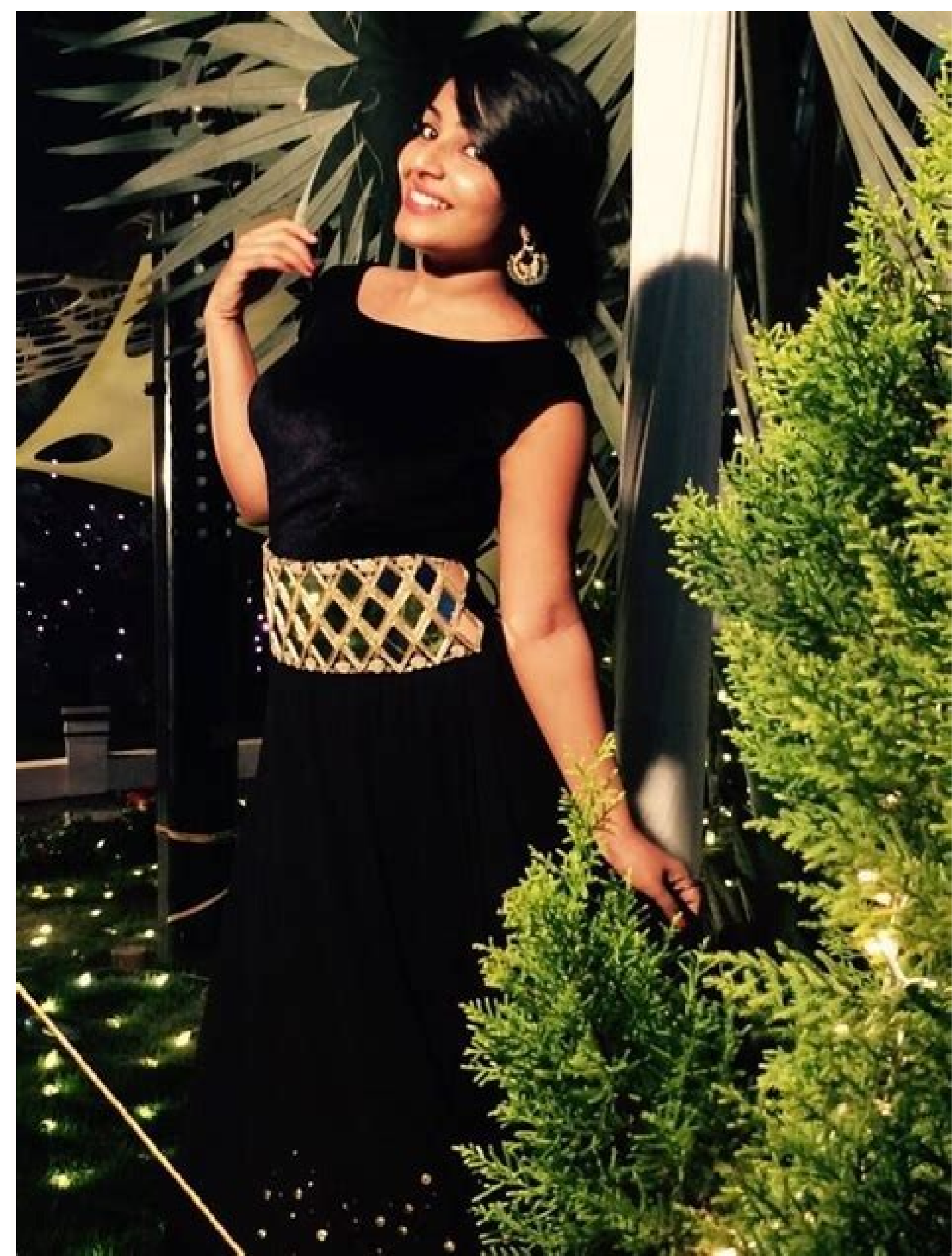
Anuraga karikkin vellam ringtone download. Anuraga karikkin vellam flute ringtone.